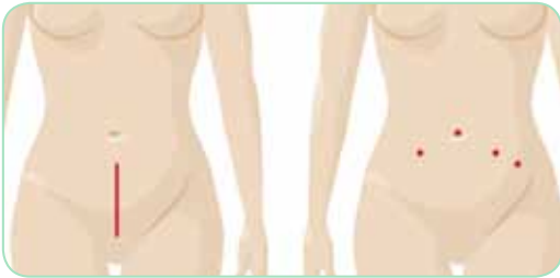
Open Surgery Incision

Fortunately, there is a minimally invasive treatment for endometriosis designed to overcome the limits of both open and traditional laparoscopic surgery.